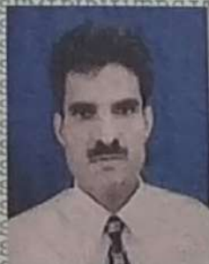
Photograph of the Candidate