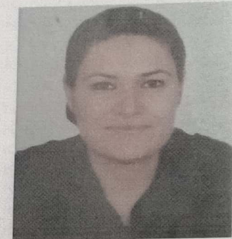
Photograph of the bearer