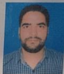
Photograph of the bearer