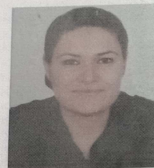
Photograph of the bearer